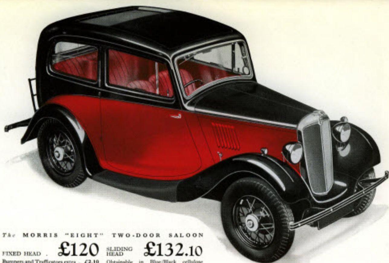
The MORRIS "EIGHT" TWO-DOOR SALOON

In addition to the General Equipment the Sliding Head model has: Pytchley sliding head, single-panel adjustable windscreen and winding door windows with Triplex toughened glass, interior driving mirror, concealed direction indicators, trafficator mirrors, concealed rear blind with remote control, private locks to doors, bucket type front seat, sliding driver's seat, adjustable tip-up passenger's seat.