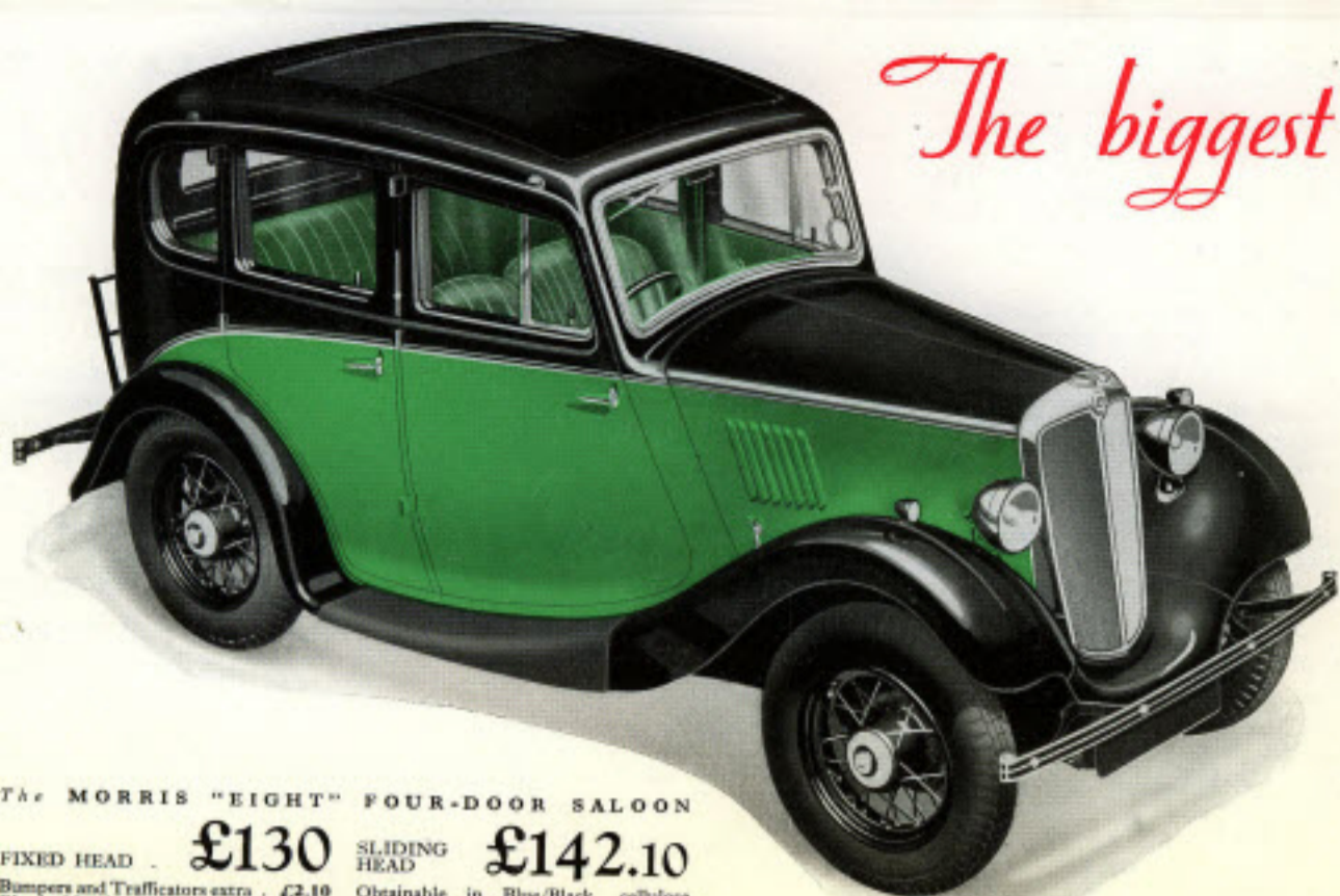
The MORRIS "EIGHT" FOUR-DOOR SALOON

The biggest value for money range ever announced