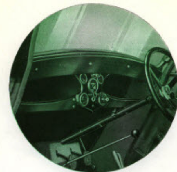
THE HANDSOME FACIA BOARD with two large cubbies and full instrument equipment attractively grouped

Look carefully at the specification of the new Morris "Eight." Where will you find any small car with so many big-car features, such roomy bodies, such comfortable upholstery and such driving ease?