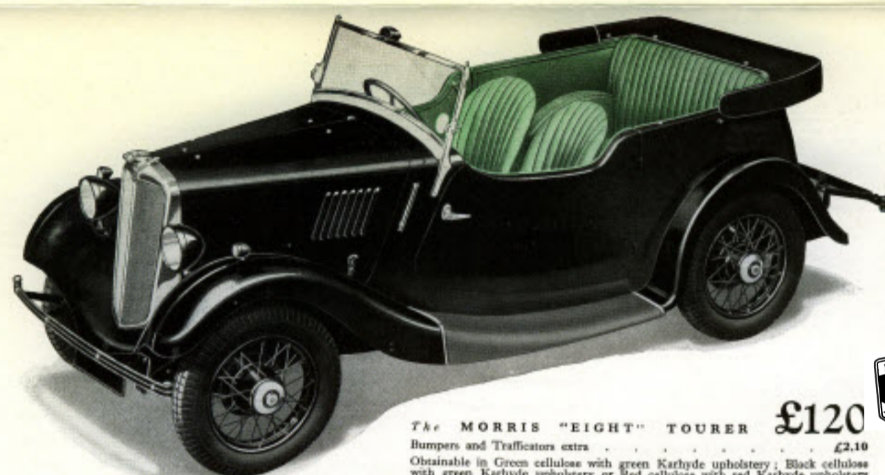
The MORRIS "EIGHT" TOURER £120

Obtainable in Blue/Black cellulose with blue leather upholstery; Green/Black cellulose with green leather upholstery; or Red/Black cellulose with red leather upholstery